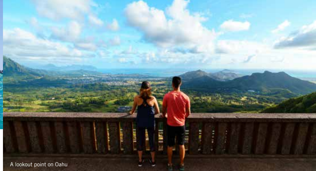
A lookout point on Oahu