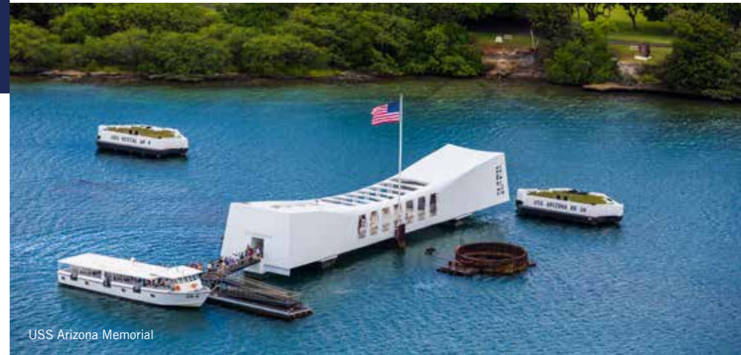
USS Arizona Memorial

The Ritz-Carlton offers something for everyone with its Nalu Spa, stables, fitness center, pickleball, tennis, and oceanside pools. Take a day trip to Honolulu to visit the Pearl Harbor National Memorial , see Travel+Leisure's 2025 top beach—Kahanamoku Beach at Waikiki—or hike Diamond Head for fantastic views.