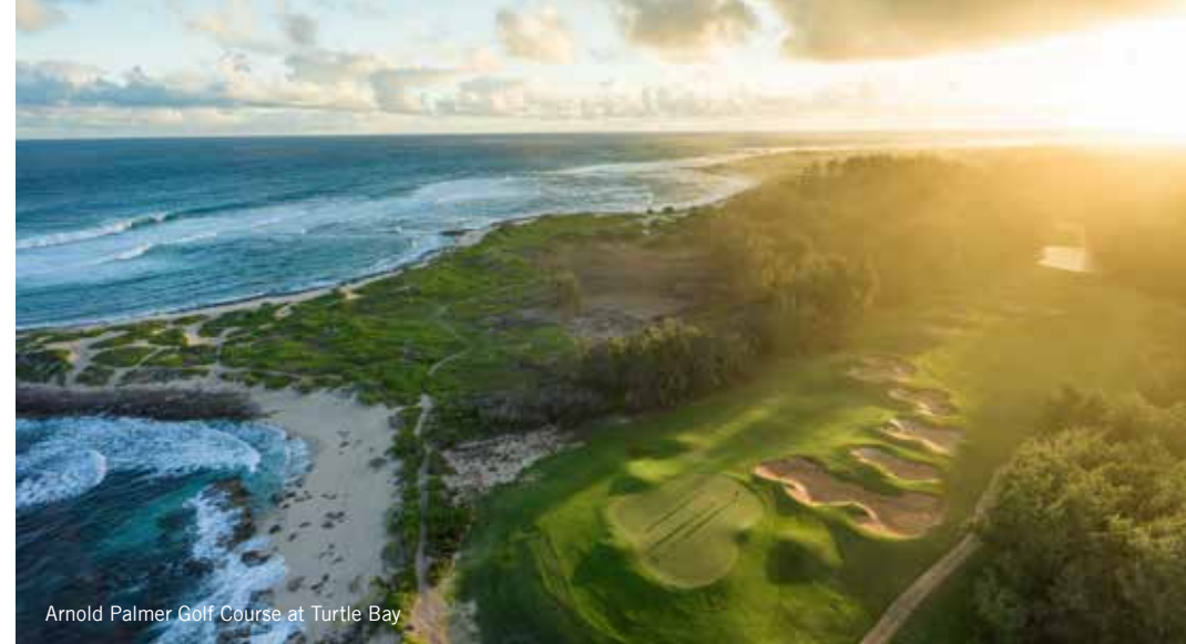
Arnold Palmer Golf Course at Turtle Bay