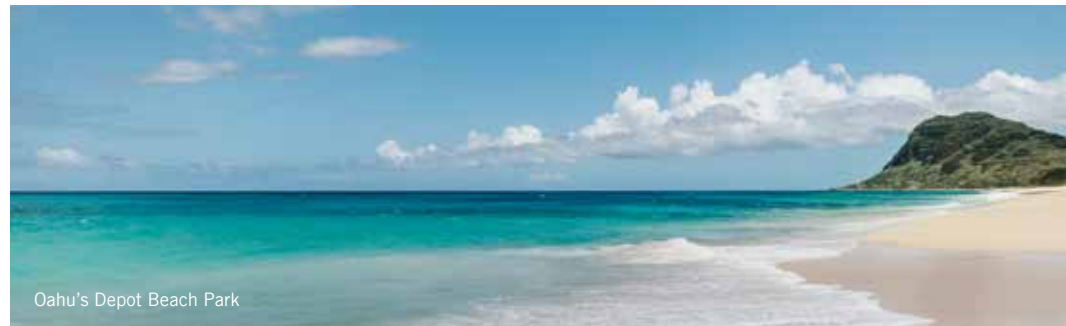
Oahu's Depot Beach Park