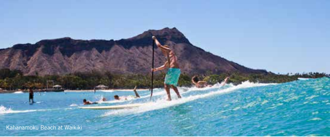
Kahanamoku Beach at Waikiki